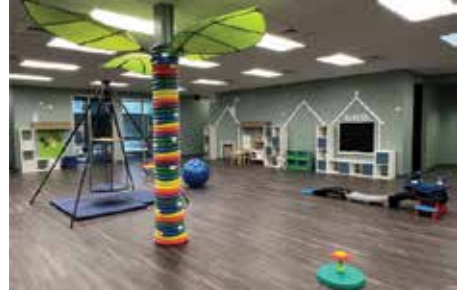
Apara Autism Center 1922 Dry Creek Way Bldg. 2, Ste 101 San Antonio, TX 78259