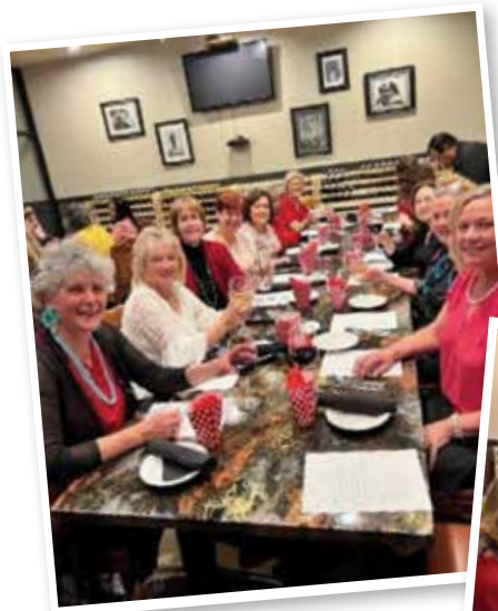
The Women's Club at Milano Italian Grill for our February "Galentine's" meeting.

Friday, May 6th and Saturday, May 7th are the dates for the Encino Park neighborhood garage sale this year. The Women's Club pays for advertising in the San Antonio Express-News and publicizes it on numerous other online and social media sites. Each individual home having a garage/yard sale should get a permit from the city of San Antonio. You can get one online very easily, or at HEB.